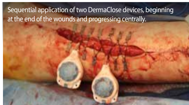
Sequential application of two DermaClose devices, beginning at the end of the wounds and progressing centrally.