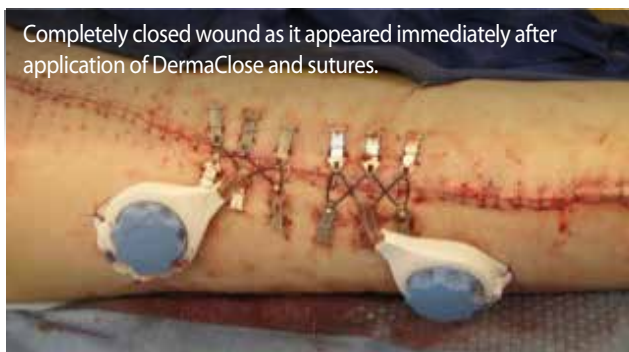
Completely closed wound as it appeared immediately after application of DermaClose and sutures.