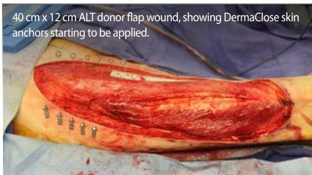
40 cm x 12 cm ALT donor flap wound, showing DermaClose skin anchors starting to be applied.