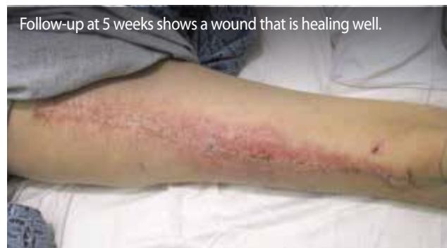
Follow-up at 5 weeks shows a wound that is healing well.

A typical DermaClose case: DermaClose used in primary closure of large anterolateral thigh donor site defect.