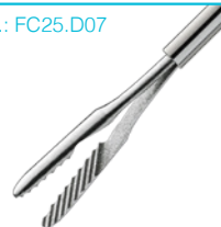
25G Forceps Shah X-tra Grip