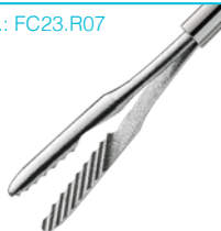
23G Forceps Shah X-tra Grip