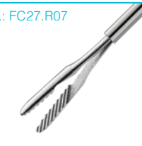
27G Forceps Shah X-tra Grip