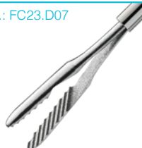
23G Forceps Shah X-tra Grip