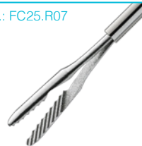
25G Forceps Shah X-tra Grip