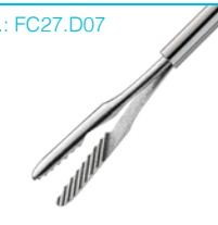
27G Forceps Shah X-tra Grip