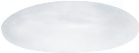
Round Moderate Profile widest base | lower profile