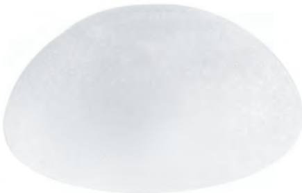
Round High Profile narrower base | higher profile