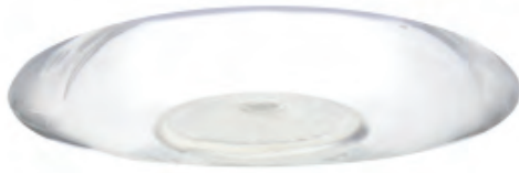
Round Low Profile wide base | lower profile