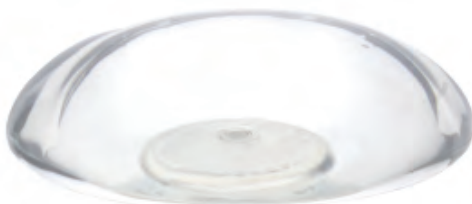
Round Moderate Plus Profile aggressive fill | moderate base | higher profile