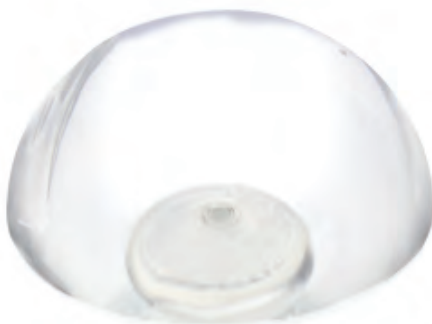
Round Ultra High Profile narrowest base | highest profile