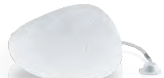
SILTEX™ CONTOUR PROFILE™ SPECTRUM™ Implant