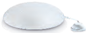
SILTEX™ ROUND BECKER™ Expander/Implant 25