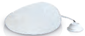
SILTEX™ CONTOUR PROFILE™ BECKER™ Expander/Implant 35