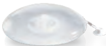
SMOOTH ROUND SPECTRUM™ Implant

This unique offering from Mentor, like the BECKER™ Expander/Breast Implants, combines tissue expansion with a longterm saline breast implant. Accessible through the skin and self-sealing after desired proportions have been achieved 13 , SPECTRUM™ Implants provide similar features to the BECKER™ Expander/Implants.