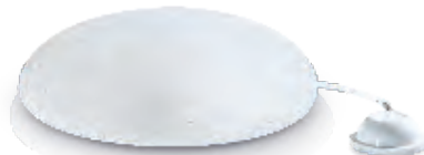
SILTEX™ ROUND BECKER™ Expander/Implant 50