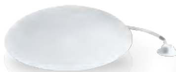
SILTEX™ ROUND SPECTRUM™ Implant